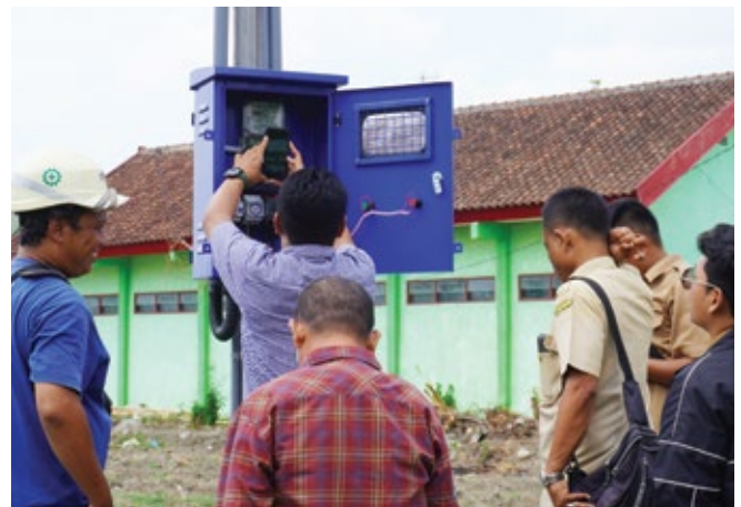
The EMCL PJU program involves the Government and stakeholders to ensure alignment with community needs and long-term functionality of the lights.