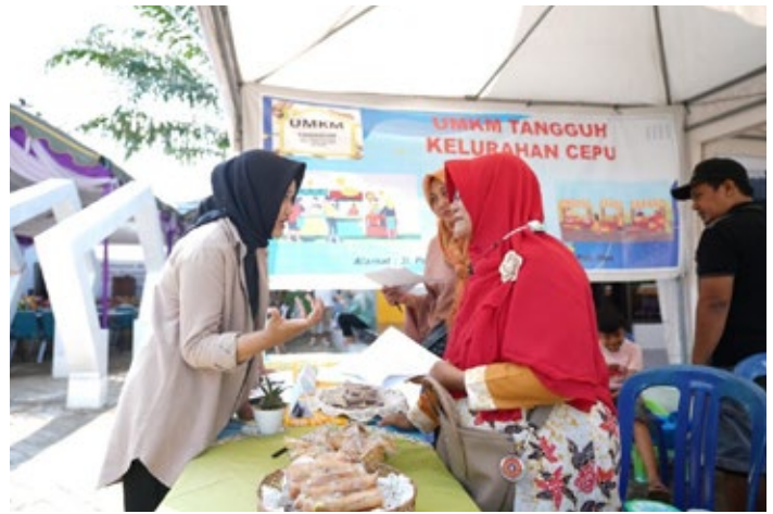
Cepu's small businesses sell at CRECO, boosting the local economy.