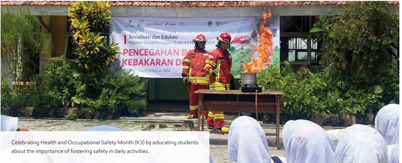
Celebrating Health and Occupational Safety Month (K3) by educating students about the importance of fostering safety in daily activities.

From mid-January to February, workers at the Banyu Urip Field commemorated the Health and Occupational Safety Month (K3). Various activities such as discussions, running competitions, blood donation drives, and safety video contests were held with great enthusiasm. Occupational Health and Safety became the main topic of conversation throughout the month. However, what left the most lasting impression on them was the opportunity to engage with the students of SMP Negeri 1 Gayam District.