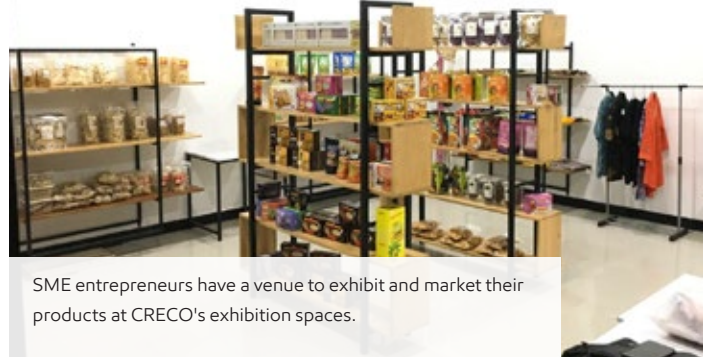
SME entrepreneurs have a venue to exhibit and market their products at CRECO's exhibition spaces.