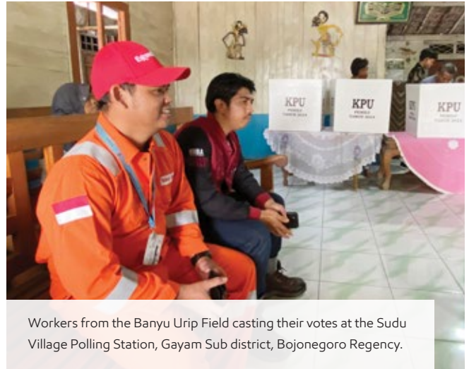
Workers from the Banyu Urip Field casting their votes at the Sudu Village Polling Station, Gayam Sub district, Bojonegoro Regency.

The state ensures that all citizens can exercise their choices in elections. ExxonMobil Cepu Limited (EMCL) also ensures that every worker in the operational area obtains this political right. This includes personnel working on the FSO Gagak Rimang.