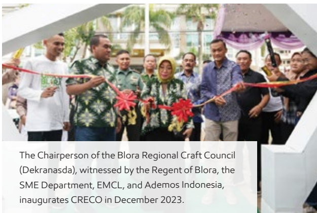
The Chairperson of the Bloro Regional Craft Council (Dekranasda), witnessed by the Regent of Bloro, the SME Department, EMCL, and Ademos Indonesia, inaugurates CRECO in December 2023.

CRECO serves as a platform to empower SMEs in Bloro Regency to compete effectively. At least 44 SMEs have joined this ecosystem. Ademos Indonesia, a partner in EMCL's program, has conducted mapping of SMEs and potential markets. The goal is for SMEs not only to succeed locally but also to thrive in broader markets. •