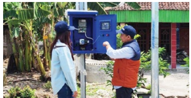
PJU installations are ensured to meet Government standards and maintain high quality.

"The road access is much more comfortable now when driving at night. It's more comfortable because the visibility is clearer, and we're not afraid of security issues."