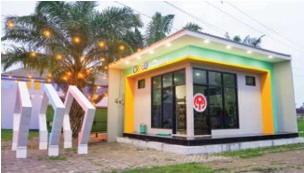
EMCL constructs exhibition spaces to showcase and sell SME products in Bloro Regency.

The Bloro Regency Government's aspirations for accelerating economic growth have received support from various parties, including ExxonMobil Cepu Limited (EMCL) through the Cepu Creative Community (CRECO).