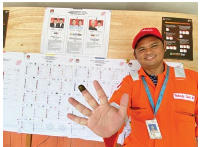
The workers exercise their voting rights freely, with a spirit of contributing to the nation's development.