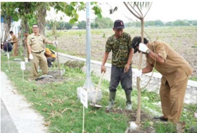
The village government, along with residents and community leaders, collectively plant trees next to the Public Street Lighting in Kedungadem Village, Kedungadem Sub district, Bojonegoro Regency.

Moreover, in the PJU in Panjang Village, Kedungadem sub district, EMCL, along with partners and the community, also conducted a collective effort to plant hundreds of trees. Through this program, the community now enjoys comfortable driving conditions, as the night is bright, and the day is shady. •