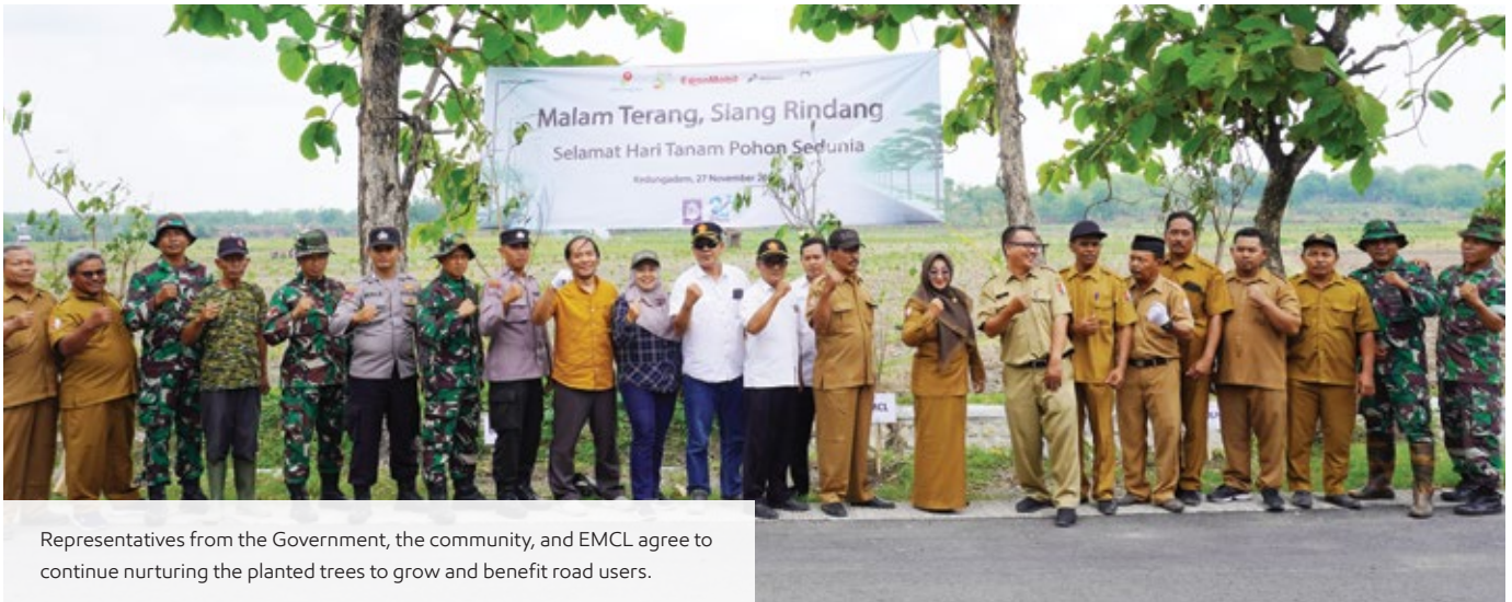
Representatives from the Government, the community, and EMCL agree to continue nurturing the planted trees to grow and benefit road users.

The roads are smooth, facilitating transportation, but they can be dangerous when it's dark. Accidents can occur due to impaired visibility. Therefore, street lighting is a safety factor at night.