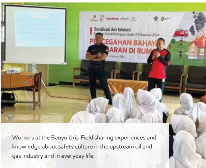
Workers at the Banyu Urip Field sharing experiences and knowledge about safety culture in the upstream oil and gas industry and in everyday life.