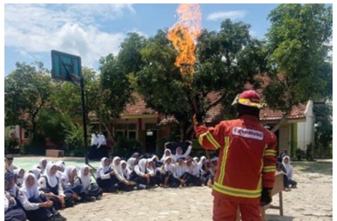
Students of SMP Negeri 1 Gayam District receiving training on extinguishing household fires.

Following the classroom session, students participated in a practical fire extinguishing exercise. Here, they learned how to handle small fires using everyday household items and observed the use of Fire Extinguishers. •